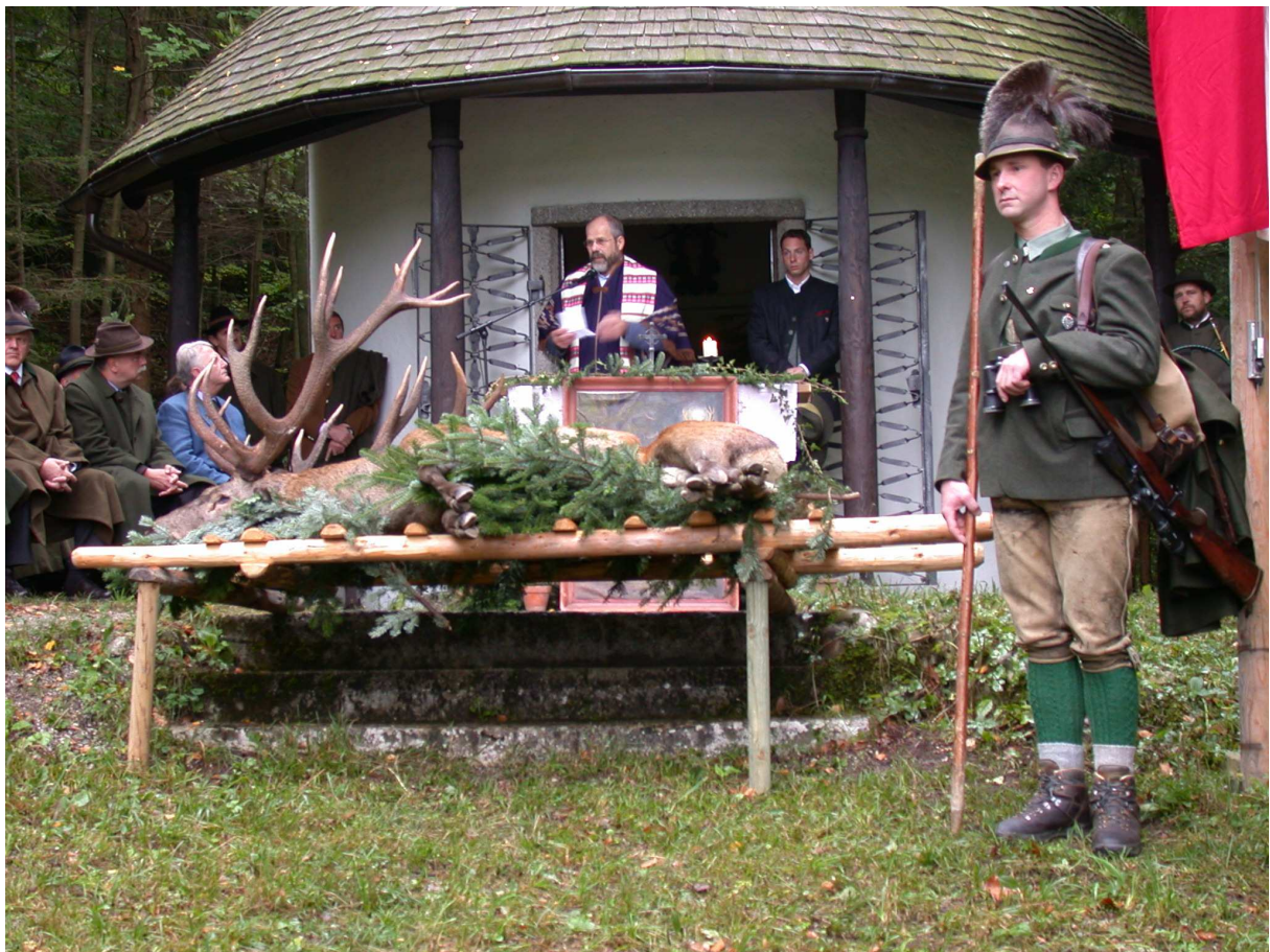
Pagan tradition: priests bless the hunt and the hunters

Theodor Heuss, who, as the first president of the Federal Republic of Germany frequently had to participate on hunts organized for diplomats, said in a felicitously: “Hunt is nothing more than the coward circumscription of particularly coward murder of fellow creature that has not the slightest chance. It is variant of a mental disease”.