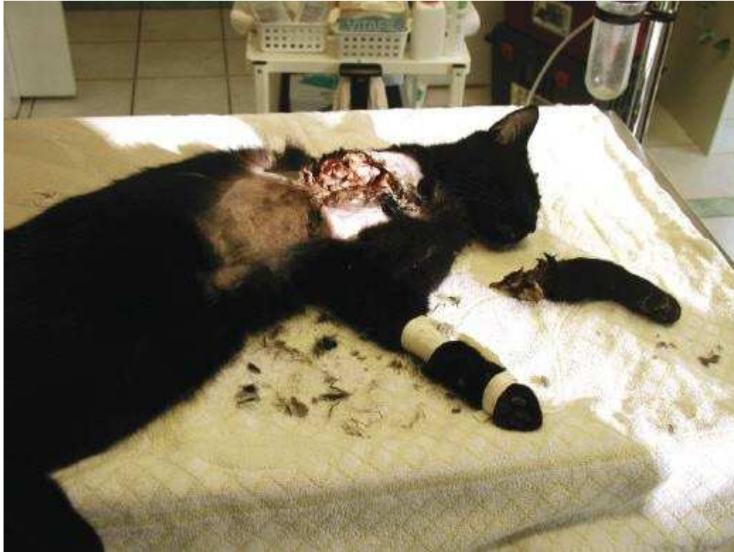
Photo above: Ariel, the one-year-old tomcat got caught in a trap - he survived though, but he has only three legs left.