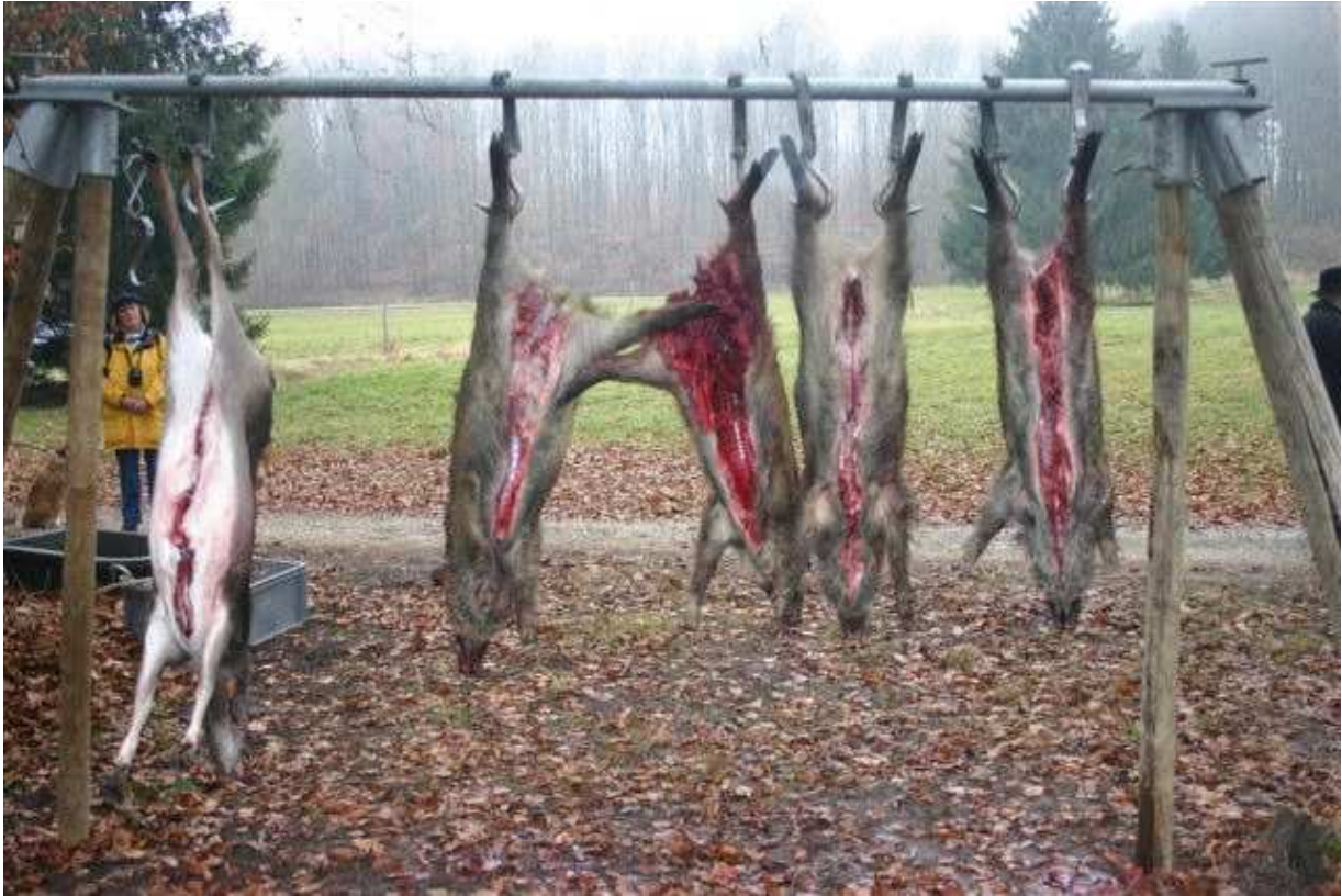
Every 6 seconds a feral animal is killed by a hunter.