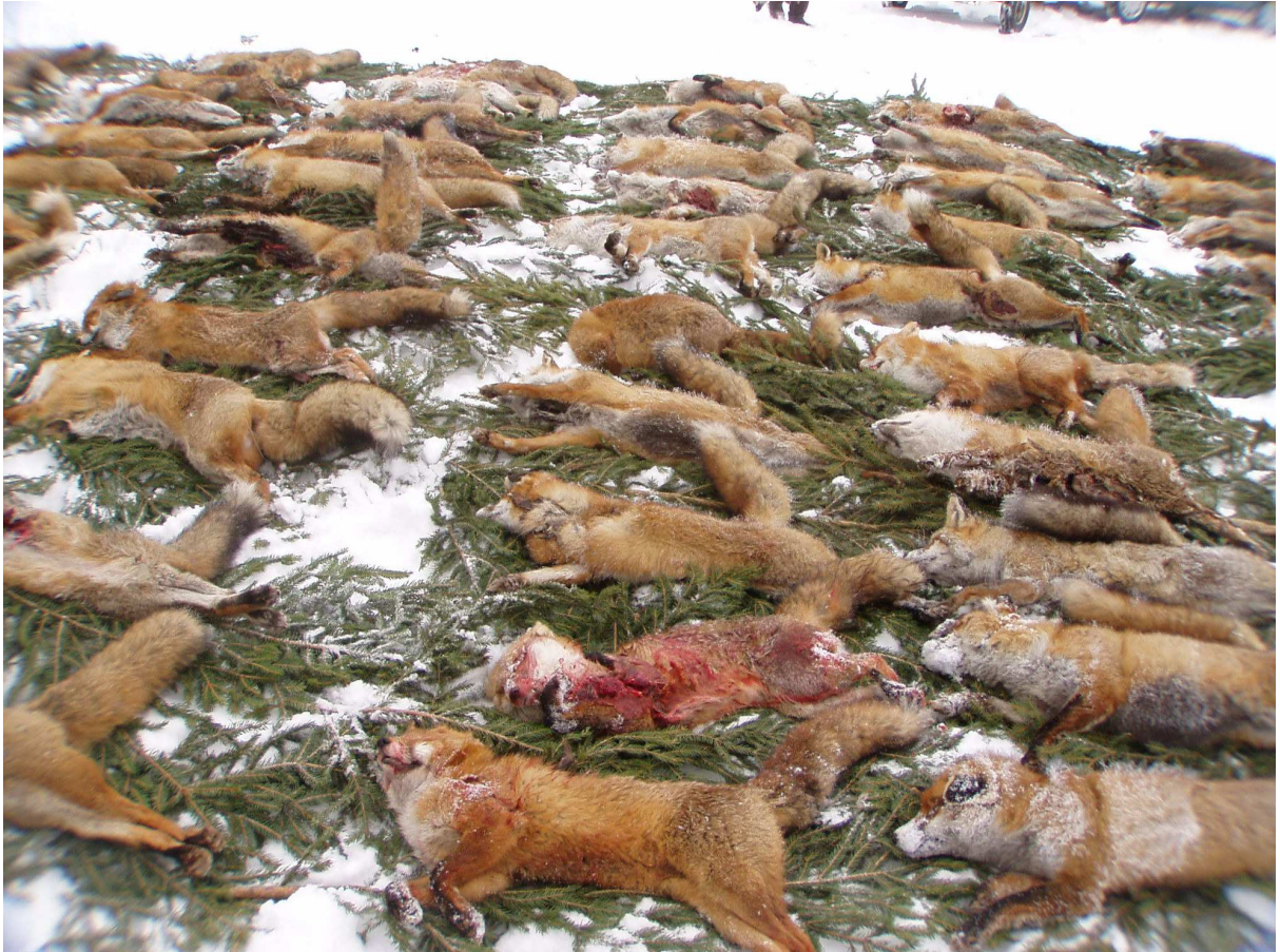
“But Hunting Is Still A Form Of War.” (Johann Wolfgang von Goethe)