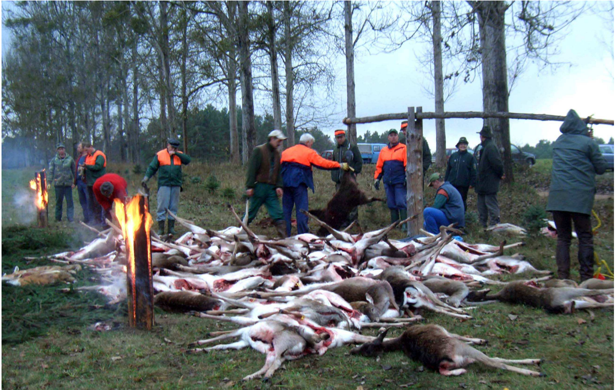
In Germany every year 5,000,000 animals get shot, beaten to death, or snared in traps.