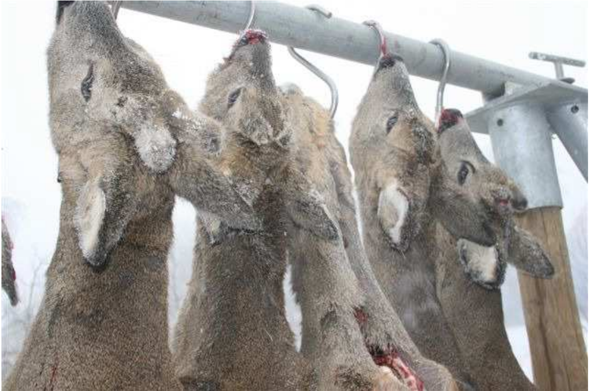
Roe deer shot in the close season